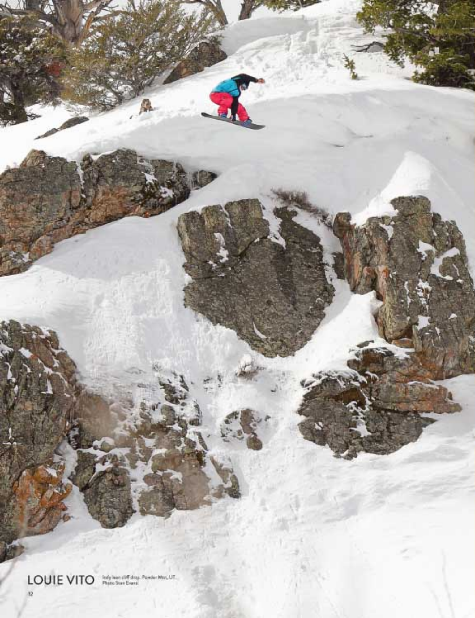
LOUIE VITO Inky lean cliff drop, Powder Mtn, UT.