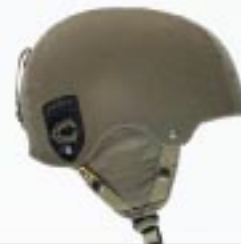
ARMY GREEN CANVAS