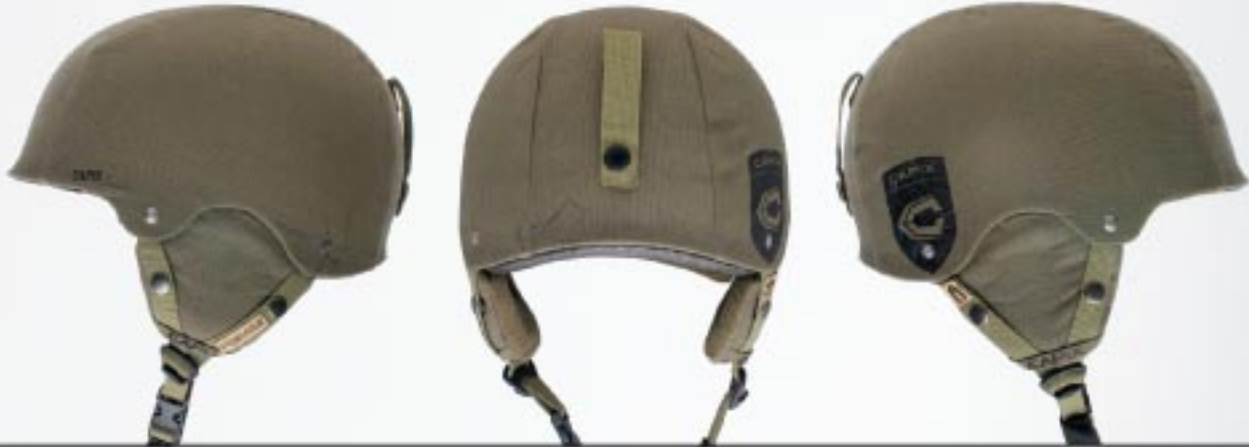
ARMY GREEN CANVAS