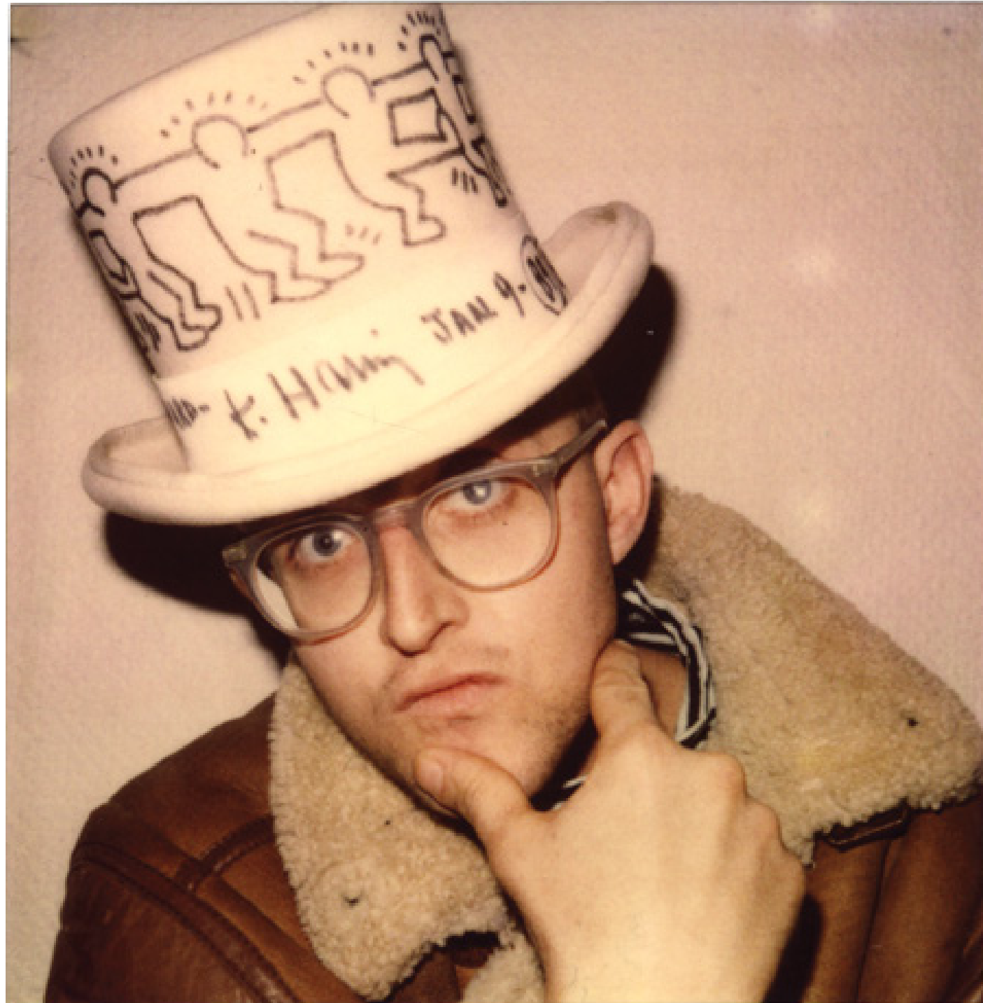
DIAMOND SUPPLY CO. | KEITH HARING COLLECTION