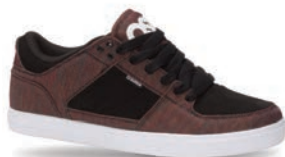
2305 BLK / WHT / CCC C / M N