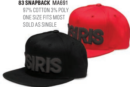
A140 BLACK / BLACK A132 RED / BLACK