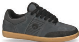
2337 CHR / GUM S / M N