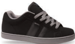
480 BLK / BLK SN / M