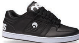
104 BLK / BLK / WHT SN / M