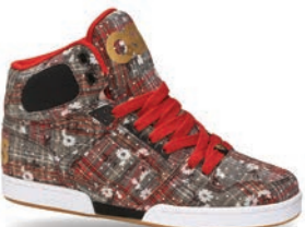
2352 IDYLLWILD C / SL / M N