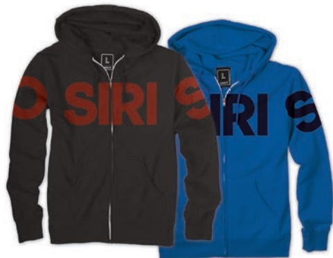
96 MK681 A118 BLK / RED A195 RYL

8.5 OZ. Pre-Laundered 80% Cotton 20% Polyester Blend Fleece 100% Cotton 40 Single Face Yarn For Supreme Printability & Softness Split Stitch Double Needle Sewing On All Seams, Twill Neck Tape