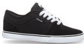
104 BLK / BLK / WHT S / C / M