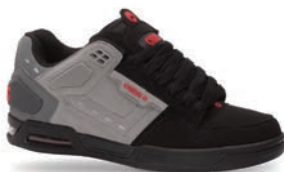
2342 GRV / RED SN / M