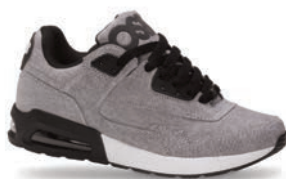
2304 BLK / OXFORD C / M N