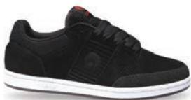
2299 BLK / RED / DPI S / M