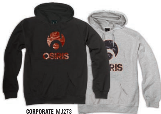
CORPORATE MJ273 A393 BLK / DPI A407 GRY / FATIGUES