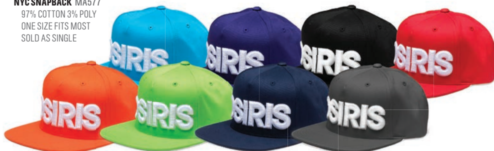
A213 TURQUOISE A106 PURPLE A104 BLACK A108 RED A231 ORANGE A315 LIME A105 NAVY A116 CHARCOAL