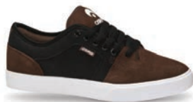
1235 BRN / BLK / WHT S / C / M N