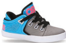
2358 SKYLER SL / C / M N