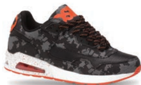
2307 FATIGUES C / M N