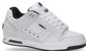
2343 WHT / BLK / STRIPE SL / M