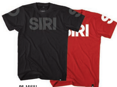
96 MI681 A140 BLK / BLK A128 RED / WHT

5.5 OZ. Soft Spun 100% Cotton Tubular Jersey Premium Short Sleeve Fit, 3/4in Set-In Collar Double-Needle Bottom Hem & Sleeves, w/ Shoulder-To-Shoulder Tape, Pre-Shrunk