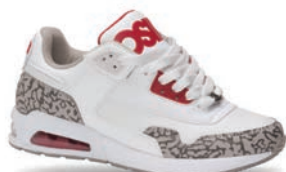
1330 WHT / GRY / RED SL / M N