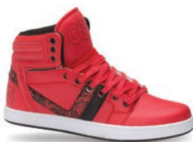
607 RED / BLK / WHT SL / M N