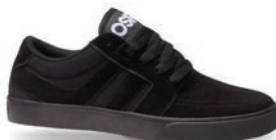
1236 BLK / BLK / BLK S / C / M