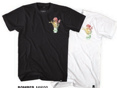
BOMBER MI690 A392 BLK / RASTA A399 WHT / RASTA *LARGE BACK PRINT