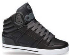
1177 BLK / BLK / CHR SL / M N