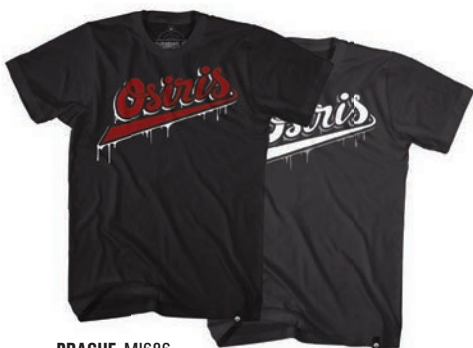
PRAGUE MI686 A118 BLK / RED A400 TAR