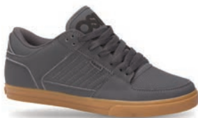
2337 CHR / GUM SN / M N