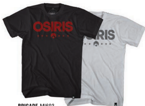
BRIGADE MI693 A118 BLK / RED A146 SIL