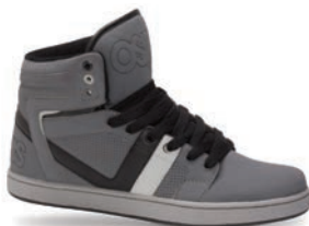
1532 CHR / BLK / GRY SN / SL / M N