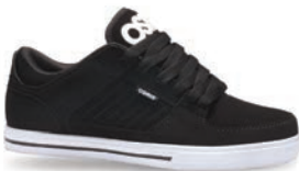
104 BLK / BLK / WHT SN / M