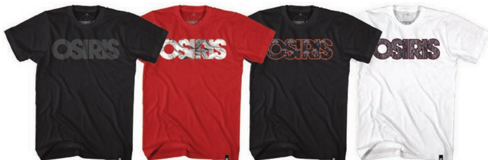
NYC MI577 A140 BLK / BLK