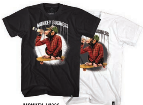
MONKEY MI383 A117 BLK / WHT A147 WHT / BLK