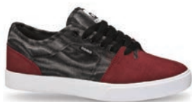
2338 GRAIN S / C / M N