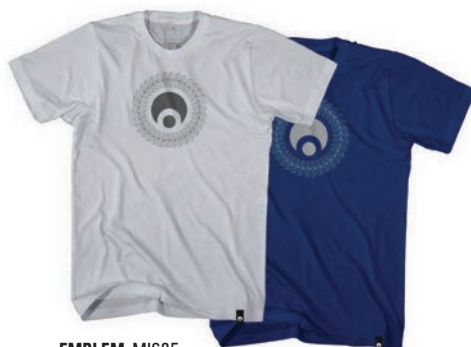
EMBLEM MI685 A146 SIL A195 RYL