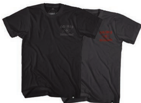
SKATEBOARDING MI670 A140 BLK / BLK A400 TAR