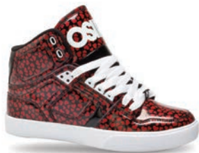
2350 DOROTHY SL / M