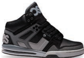
312 BLK / CHR SL / M