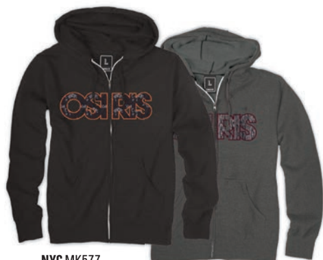
NYC MK577 A404 BLK / FATIGUES A406 CHR / GRAIN