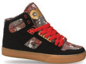
2352 IDYLLWILD SL / C / M