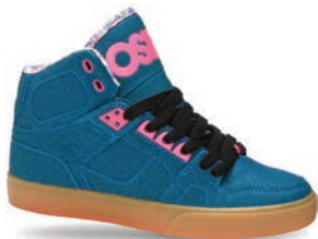
2353 Nvy / PNK / GUM SL / C