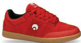
2303 RED / GUM / WHT S / M N