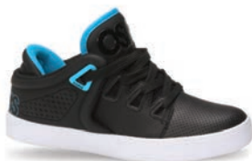
2357 BLK / TIF SL / SN / M N