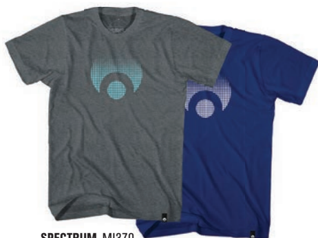
SPECTRUM MI370 A408 SIL / BLU A195 RYL