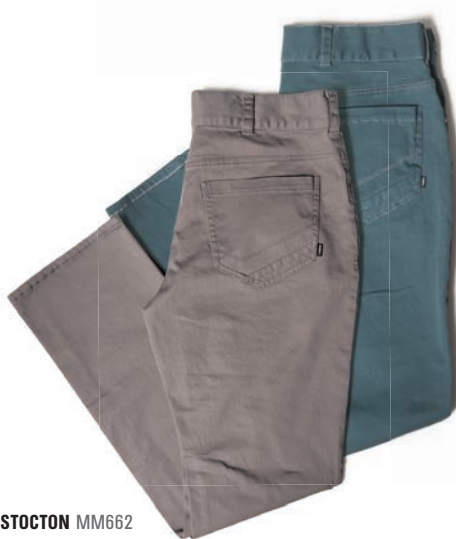
STOCTON MM662 MENS TWILL PANT 98% COTTON 2% SPANDEX A111 GREY SOLD AS SINGLE A193 GREEN 30, 32, 33, 34, 36