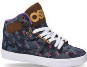
2355 VERUCA C / S / M