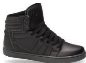
1236 BLK / BLK / BLK SL / M N