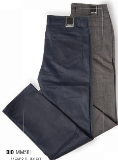
DIO MM581 MEN'S SLIM FIT 98% COTTON 2% POLY A262 INDIGO SOLD AS SINGLES A361 RAW 30, 32, 34, 36, 38