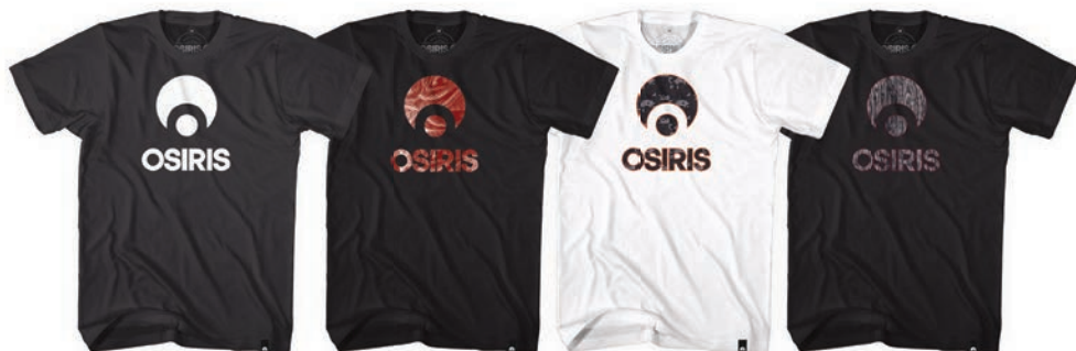
CORPORATE MI273 A400 TAR