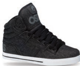
2363 DNM / CHR / BLK C / M N