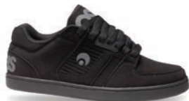
1177 BLK / BLK / CHR SN / M