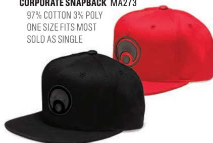
A140 BLACK / BLACK A132 RED / BLACK