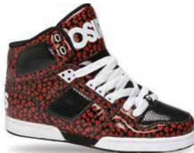
2350 DOROTHY SL / M N