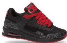
272 BLK / GRY / RED SL / M N