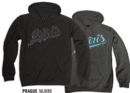
PRAGUE MJ686 A104 BLK A259 CHR / HTR