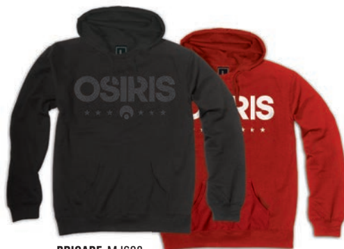
BRIGADE MJ693 A140 BLK / BLK A108 RED