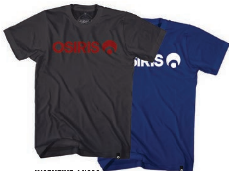
INCENTIVE MI692 A400 TAR A195 RYL