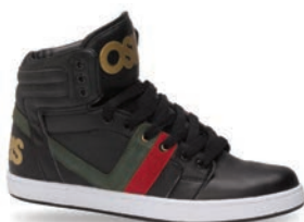
1499 BLK / RED / GRN S / SL / M N