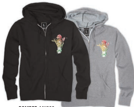
BOMBER MK690 A392 BLK / RASTA A211 GRY / HTR