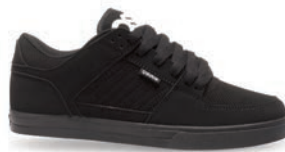
1236 BLK / BLK / BLK SN / M