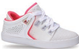
2360 WHT / PNK / SIL SL / M N