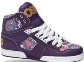
2351 GYPSY SL / C / M N