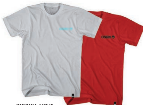
INSIGNIA MI515 A146 SIL A108 RED *LARGE BACK PRINT