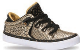
2359 SNAKE SL / M N