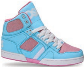
2320 BLU / PNK / CCC C / SL / M N