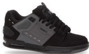
107 BLK / CHR / BLK SN / M