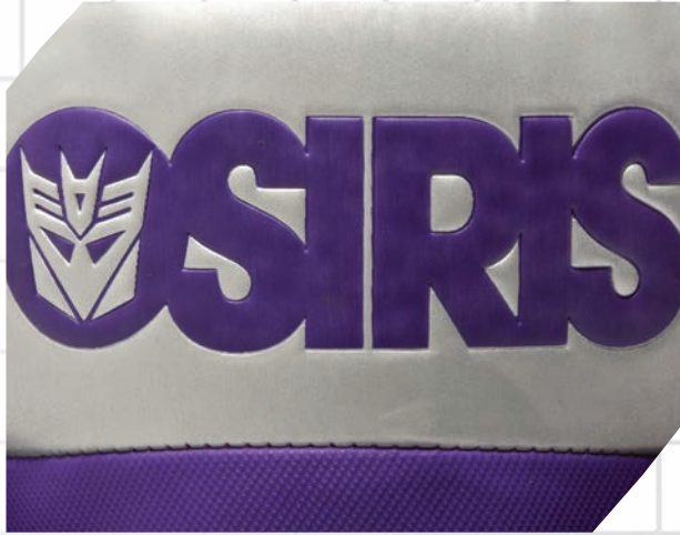
Custom Tongue Logo Application w/ DECEPTICONS Shield Incorporated Into The Osiris Logo