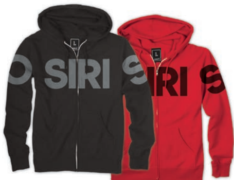
96 MK681 A104 BLACK A108 RED

8.5 OZ. Pre-Laundered 80% Cotton 20% Polyester Blend Fleece 100% Cotton 40 Single Face Yarn For Supreme Printability & Softness Split Stitch Double Needle Sewing On All Seams, Twill Neck Tape