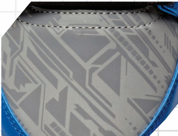
3m Reflective w/ GEN1 Artwork Application