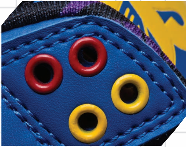
SOUNDWAVE Inspired Colorway & Materialization