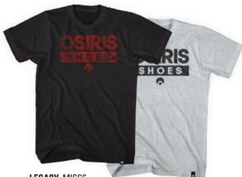
LEGACY MI666 A393 BLACK / DPI A120 HEATHER GREY