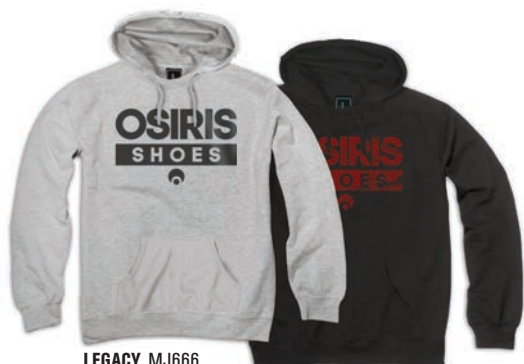
LEGACY MJ666 A120 HEATHER GREY A393 BLACK / DPI