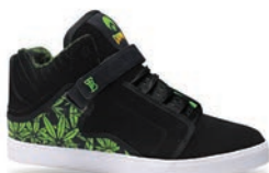
2300 BLK / CREATURE S / C / M