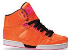
2321 ORG / WHT / DPI C / M N