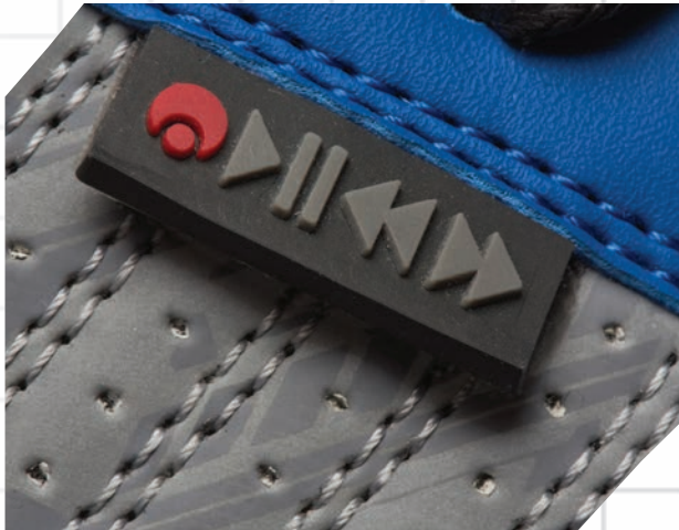
Custom TPR Molded SOUNDWAVE Logo Application