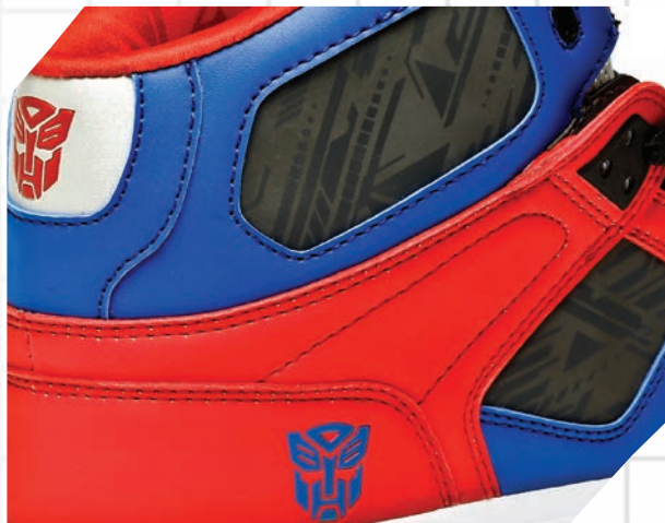
OPTIMUS PRIME Inspired Colorway & Materialization