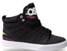
2318 BLK / 80S / MOD C / M N