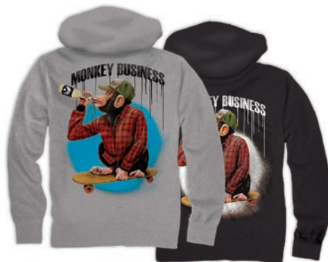
MONKEY MK383 A371 HEATHER GREY / CYAN A117 BLACK / WHITE