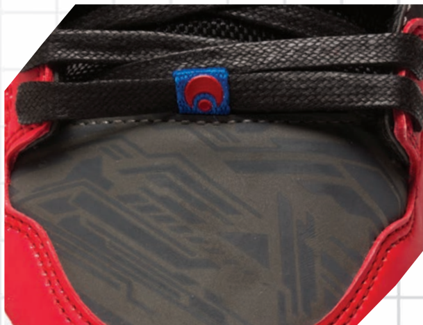
3m Reflective w/ GEN1 Artwork Application