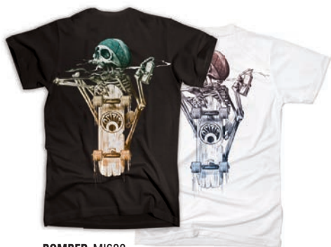
BOMBER MI690 A104 BLACK A103 WHITE