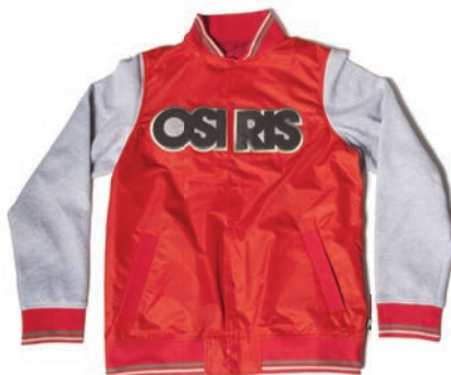
SHEFFIELD JACKET ML664

MEN'S VARSITY JACKET 70% POLY 30% COTTON SOLD AS SINGLES S-M-L-XL