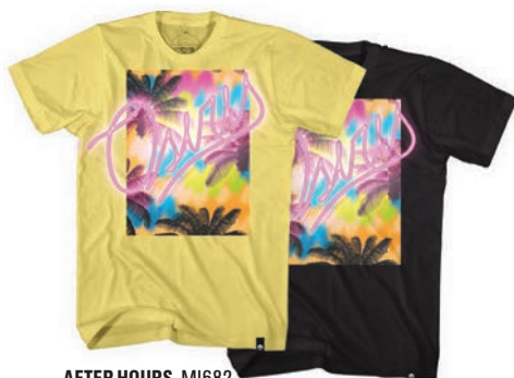
AFTER HOURS MI682 A168 YELLOW A104 BLACK