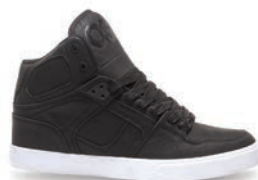
1236 BLK / BLK / BLK SL / SN / M