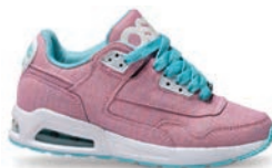
2328 PNK / BLU / CCC C / M N