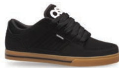
141 BLK / WHT / GUM SN / M