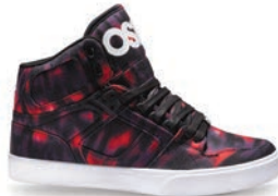
2313 RED / TIGER C / M N