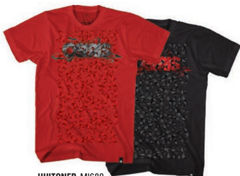
HUITONER MI689 A108 RED A104 BLACK