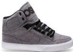
2304 BLK / OXFORD C / M N