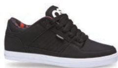
2313 RED / TIGER C / M N