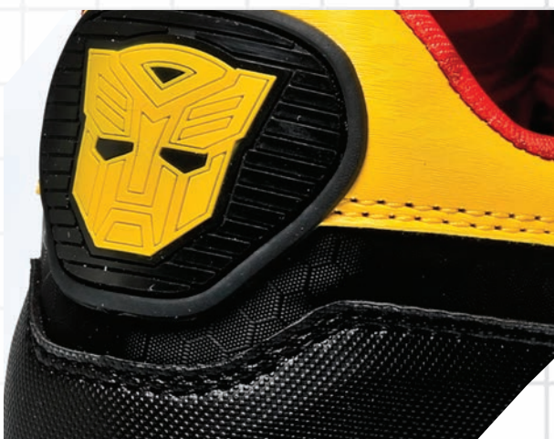
Custom TPR Molded AUTOBOTS Shield Application