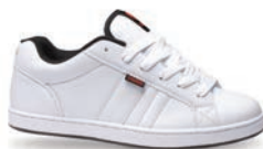
374 WHT / RED SL / M N