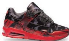
2310 HUITONER SL / M N