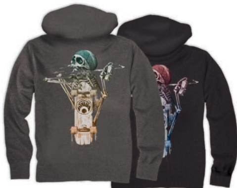
BOMBER MK690 A179 GUNMETAL A104 BLACK