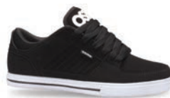
104 BLK / BLK / WHT SN / M