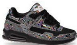
2325 BLK / SIL / TRIP SL / M N