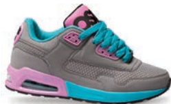
2323 GRY / PNK SN / M N