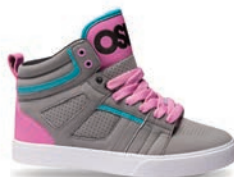
2323 GRV / PNK SN / M N