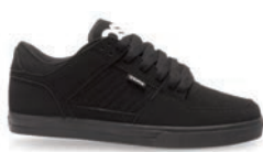
1236 BLK / BLK / BLK SN / M