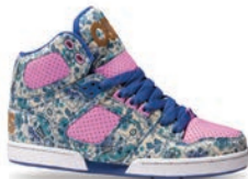
2319 BLU / PAISLEY C / SL / M N