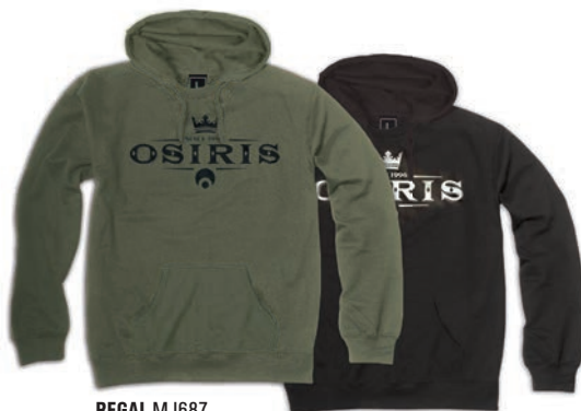
REGAL MJ687 A209 OLIVE A104 BLACK