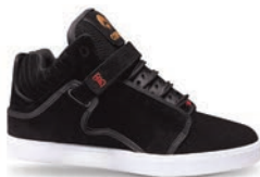
2299 BLK / RED / DPI S / M