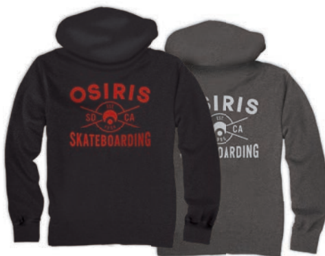
SKATEBOARDING MK670 A104 BLACK A179 GUNMETAL