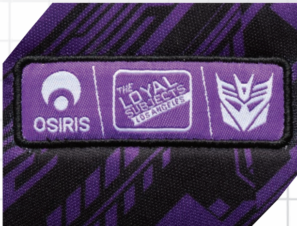
Custom Collaborative Internal Tongue Label