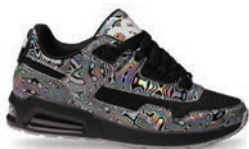
2325 BLK / SIL / TRIP L / M N