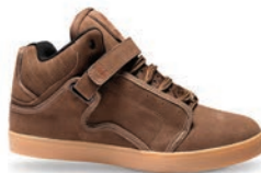
1451 BRN / BRN / GUM S / M