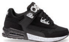
2315 BLK / WHT / SPECS SN / SL / M N