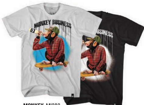
MONKEY MI383 A375 SILVER / CYAN A117 BLACK / WHITE