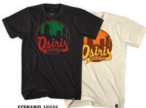
SCENARIO MI688 A104 BLACK A291 CREAM