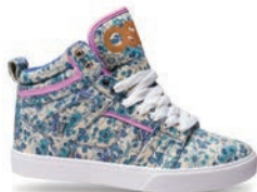
2319 BLU / PAISLEY C / M N