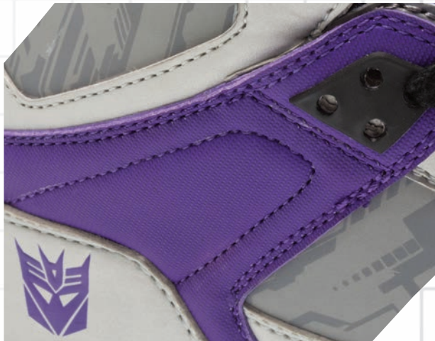
MEGATRON Inspired Colorway & Materialization