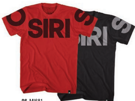
96 MI681 A108 RED A104 BLACK

5.5 OZ. Soft Spun 100% Cotton Tubular Jersey Premium Short Sleeve Fit, 3/4in Set-In Collar, Double-Needle Bottom Hem & Sleeves, w/ Shoulder-To-Shoulder Tape Pre-Shrunk To Minimize Shrinkage