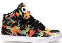
2311 BELAIRE C / M N