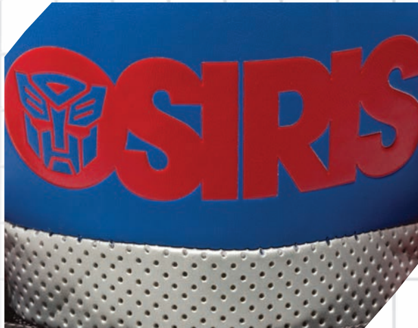
Custom Tongue Logo Application w/ AUTOBOTS Shield Incorporated Into The Osiris Logo