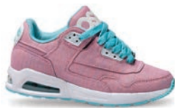
2328 PNK / BLU / CCC C / M N