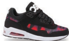
2313 RED / TIGER SN / M N