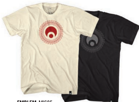
EMBLEM MI685 A291 CREAM A104 BLACK