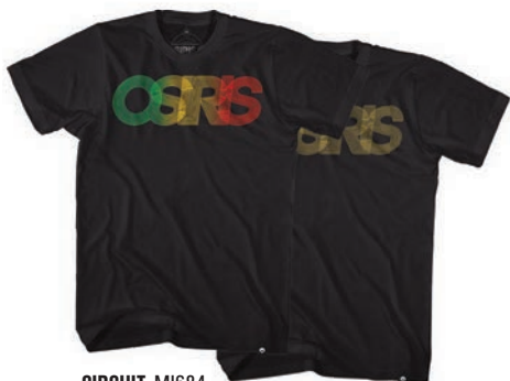
CIRCUIT MI684 A392 BLACK / RASTA A124 BLACK / GOLD