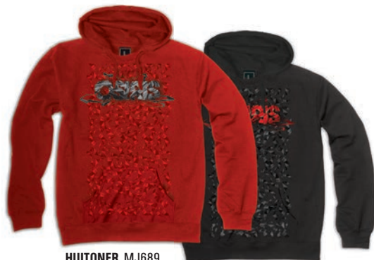
HUITONER MJ689 A108 RED A104 BLACK