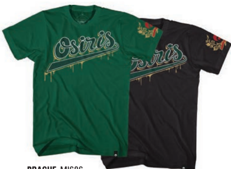
PRAGUE MI686 A193 GREEN A104 BLACK