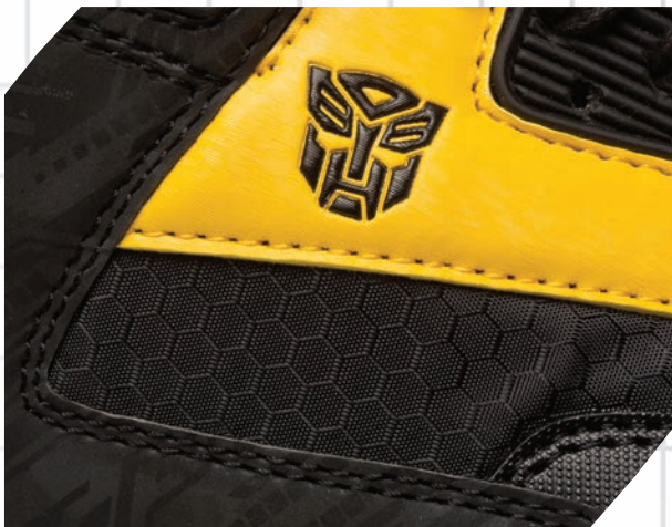
Bumblebee Inspired Colorway & Materialization