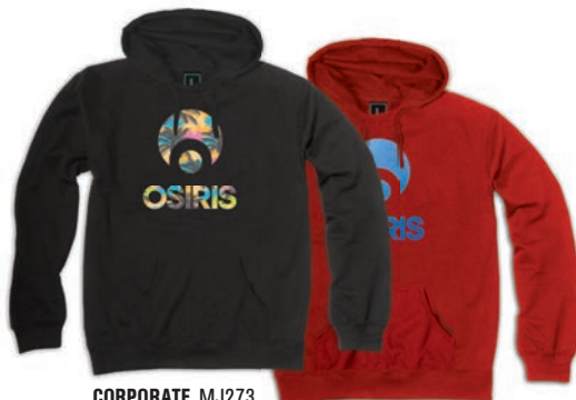
CORPORATE MJ273 A394 BLACK / BELAIRE A395 RED / FADE