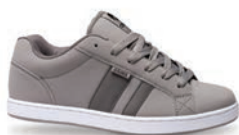
2316 GRY / GRY SN / M N