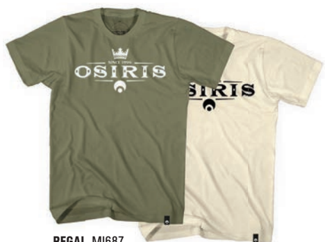
REGAL MI687 A153 ARMY A291 CREAM