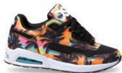
2311 BELAIRE C / M N