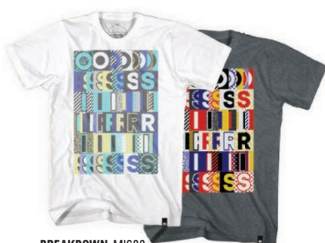
BREAKDOWN MI683 A103 WHITE A259 CHARCOAL HEATHER