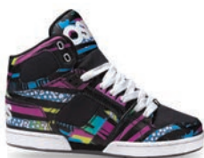
2318 BLK / 80S / MOD C / M NY