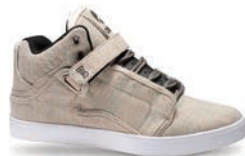
2301 GRY / CHR / CCC C / M