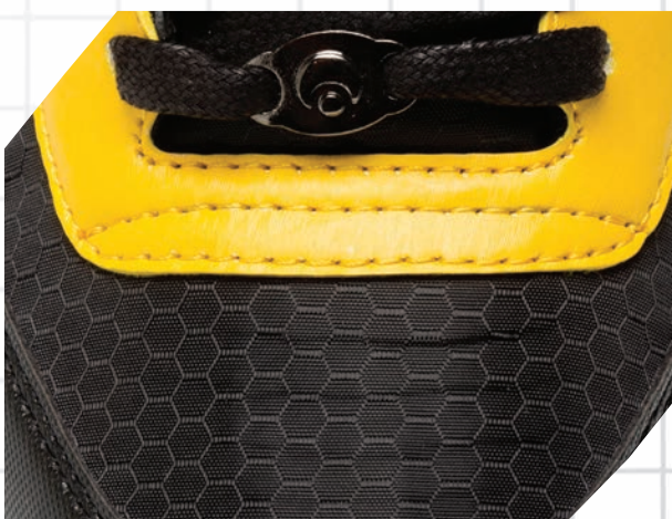
Custom Honeycomb Ripstop Material