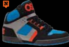
1868 BLK / AST / ORG C / C