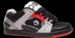
1814 BLK / CEM / RED SL / SN / M