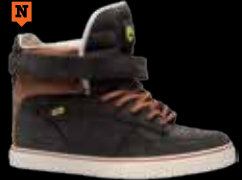
1893 CHR / NAT / CRM L / PL