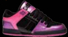
1861 PNK / PUR / BLK ME / SN / M