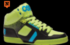
1871 LME / CYN / BLK APG / PL / M