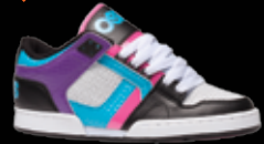
1657 BLK / CYN / PUR SL / PL / M