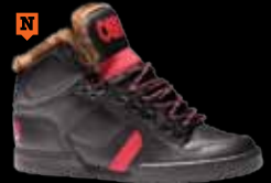
1523 BLK / RED / BLK APG / SHR