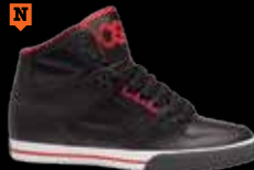
1523 BLK / RED / BLK SL / M