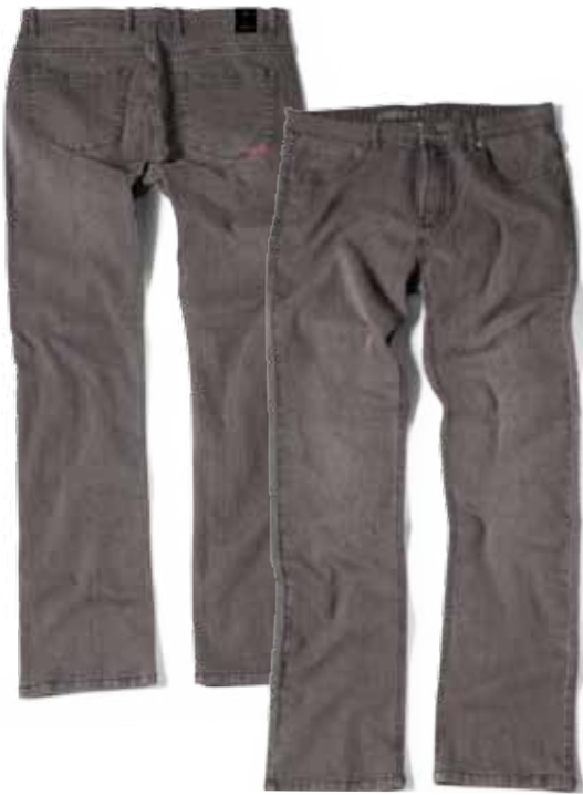
OVR DYE BLK

Jean 97% Cotton / 3% Poly 30X30,32X32,34X32,36X32,38X34 Sold As Single