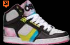
1847 BLK / PNK / HTONE APG / PL / M