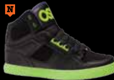
1790 BLK / LME / PUR SB / SN / M