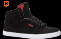
1744 BLK / CRM / RED S / C