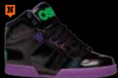
940 BLK / PUR / GRN PL / M