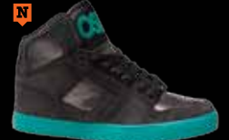
1796 CHR / GUN / TEAL S / SL / M