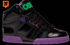
940 BLK / PUR / GRN PL / M