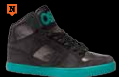
1796 CHR / GUN / TEAL S / SL / M