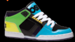
1776 CYN / LME / BLK PL / SN / M