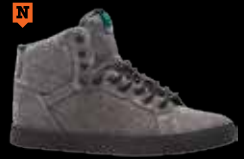
1756 BLK / TEAL / STRIPES C / C