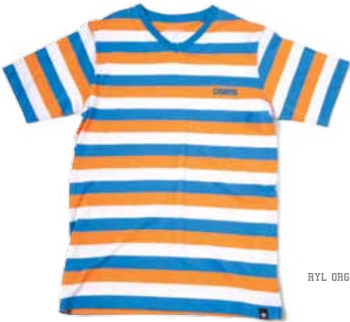
RYL ORG WHT

S/S Polo 100% Cotton S, M, L, XL, XXL Sold As Single