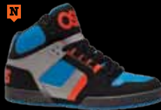
1868 BLK / AST / ORG C / C