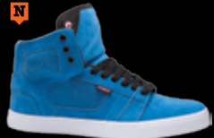
1743 AST / BLK / PNK S / M