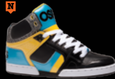
1058 BLK / CYN / YEL PL / SL / M