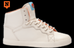
1760 GVL / ORG / BLU L / C