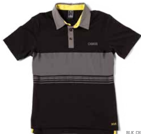
BLK CHR WHT

L/S Button Down 100% Cotton S, M, L, XL, XXL Sold As Single