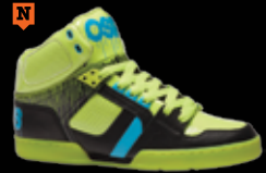
1871 LME / CYN / BLK APG / PL / M