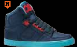
1801 TEAL / TEAL / RED C / M