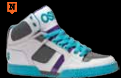
1774 WHT / PUR / TEAL APG / 3M / M