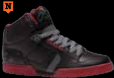
1767 BLK / RED / RR-FAISST APG / M