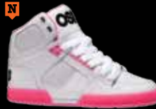
1851 WHT / PNK / ZEBRA PL / M