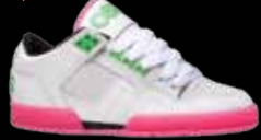
1862 WHT / PNK / GRN SL / M