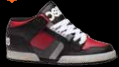
130 BLK / RED / WHT SB / SL / M