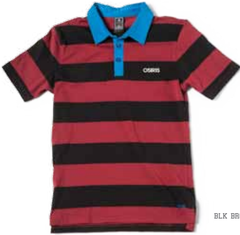
BLK BRG RYL

S/S Polo 100% Cotton S, M, L, XL, XXL Sold As Single