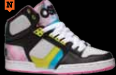
1847 BLK / PNK / HTONE APG / PL / M