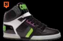
1103 BLK / GRN / WHT SB / PL / SL / M