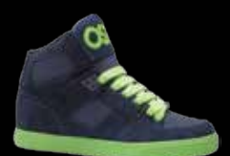
1629 NAVY / NAVY / LME S / SN / M