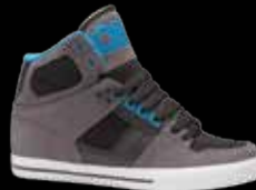
1628 CHR / BLK / AST S / SN / M