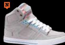
1798 GRY / MEX / RR-MILES C / C