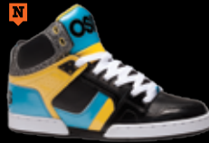
1058 BLK / CYN / YEL PL / SL / M