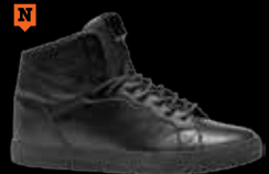
1730 BLK / B&E L / NY / C