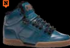
1783 IND / BLK / GUM L / SHR