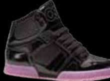
1654 BLK / LT. PNK / STARS PL / AL / M