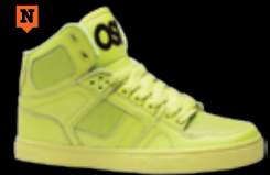
1800 LME / LME / BLK SB / SL / M