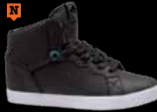
1739 BLK / TAG / RISK L / C