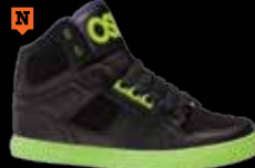
1790 BLK / LME / PUR SB / SN / M