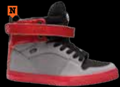
1246 GRY / BLK / RED L / PL