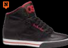
1523 BLK / RED / BLK SL / M