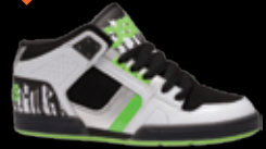
1778 WHT / LME / DRIPS PL / SN / M