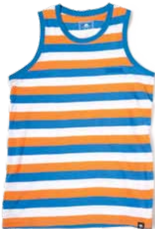
RYL ORG WHT

Tank Top 100% Cotton S, M, L, XL, XXL Sold As Single