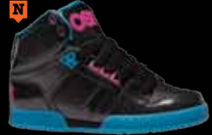
1051 BLK / CYN ME / SL / M