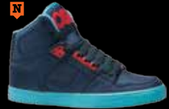
1801 TEAL / TEAL / RED C / M