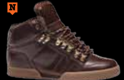
1781 BRN / GLD / GUM L / SHR