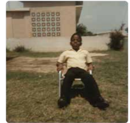
the notorious B.I.G. for primitive