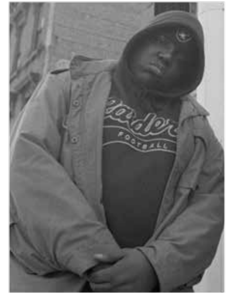
the notorious BIG for primitive