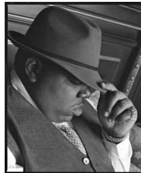
P R I M I T I V E