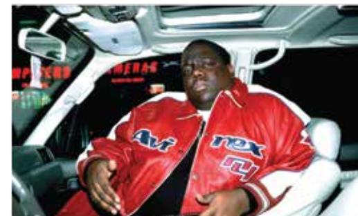
the notorious BIG for primitive