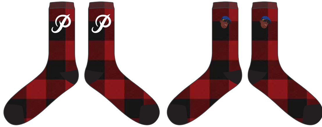
INSIDE OF SOCK