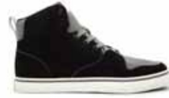
RILEY HIGH BLACK